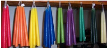
For Shimmering Simplicity

We have many different designs available to compliment your reception, either as centerpieces for your tables or to add to the general ambience.